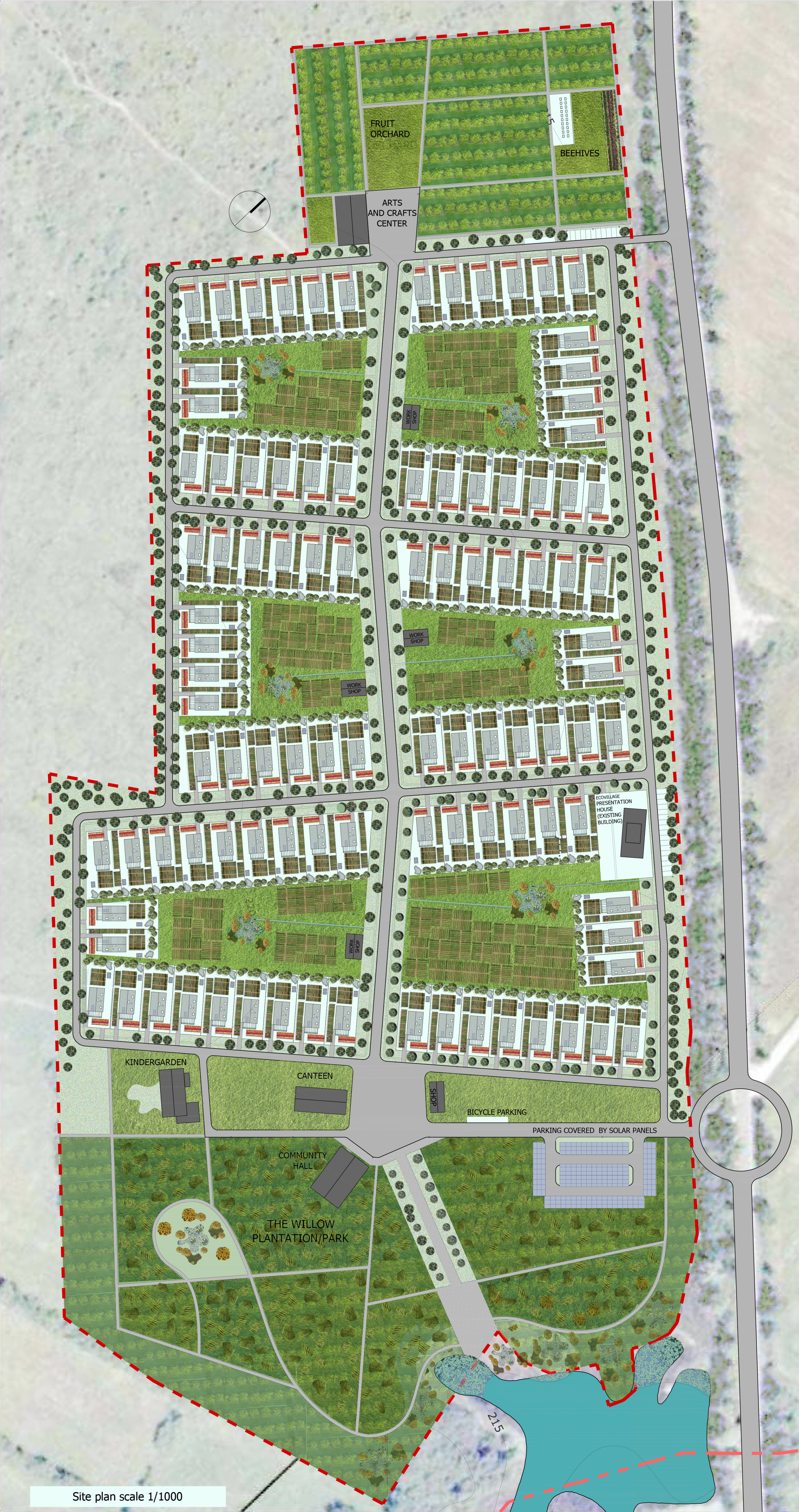
Site plan scale 1/1000