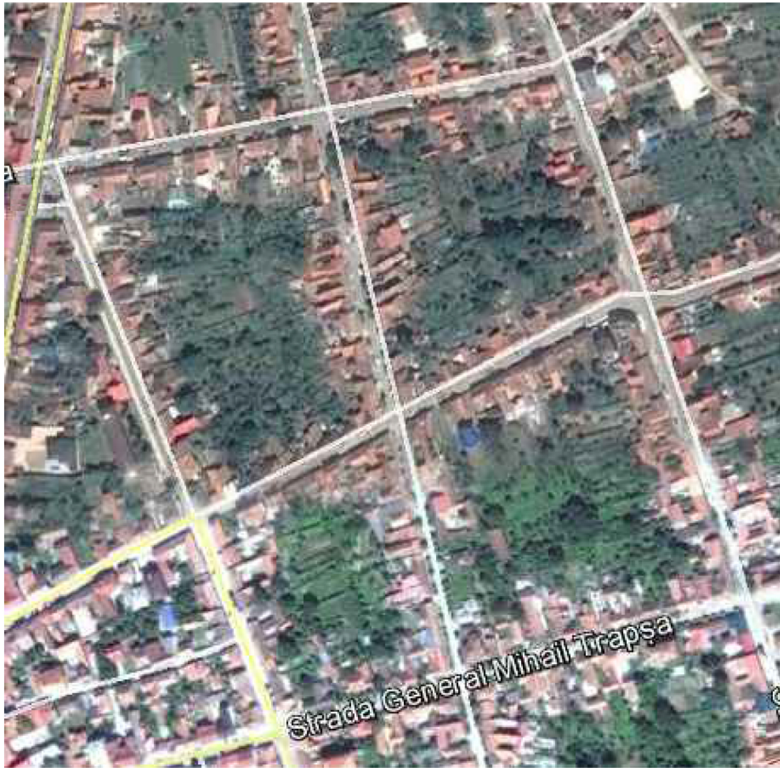
Streetscape in Caransebes

Caransebes - a model for the streetscape and siteplanning in the ecovillage: