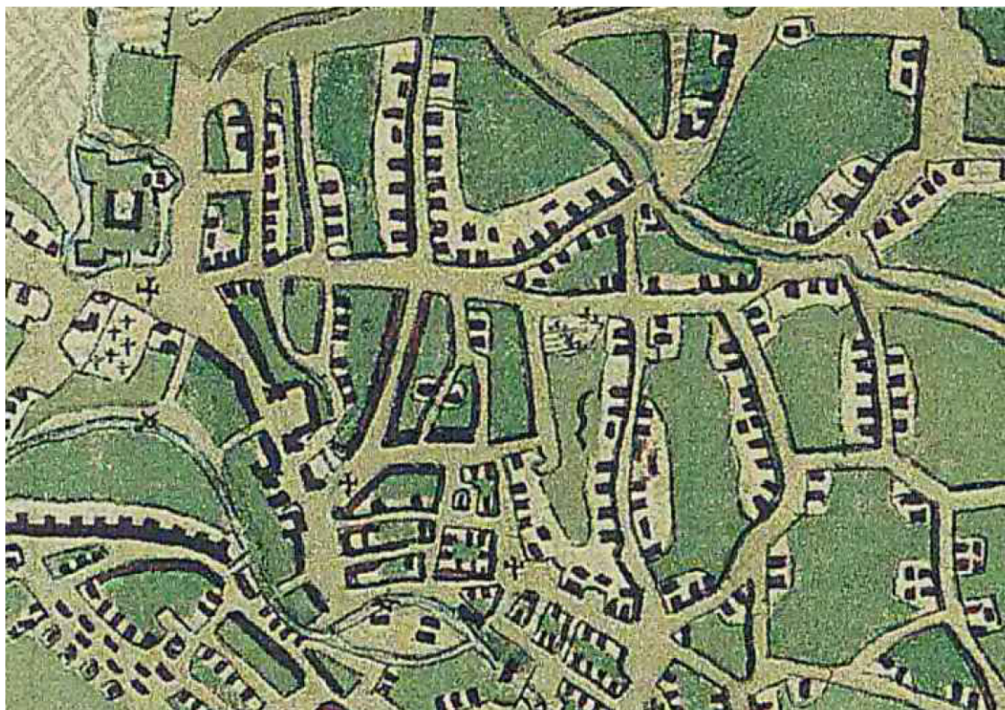
Caransebes in Harta Iosefina, 1769-72